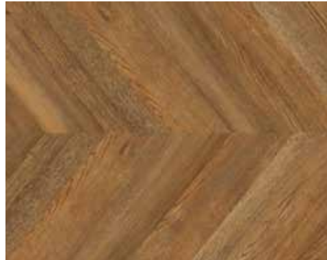
I48103CL4/CHV01 Nordic Oak Smoked

Fashion House is a conceptual, boutique-style collection of large-scale patterned floors built on the foundation of ISOCORE Technology®. The Fashion House visuals offer high-style, designer looks in wood grain patterns, which allow the end user to go beyond traditional designs into quasi-custom looks, without the additional time and expense of specifying a custom product. Fashion House floors feature a 2.0mm LVT layer and a 0.55mm commercial wear layer coated with FX3 Surface Protectant for unrivalled abrasion resistance and stain repellency. A pre-attached IXPE underlayment provides sound mitigation and enhanced comfort underfoot. Fashion House luxury vinyl flooring is both pet and kid friendly. Fashion House offers authentic colour and texture for a realistic look and feel, and features a drop-and-lock installation system making it fast and easy for both Pros and DIYers to install. Fashion House Chevron will transform your living space.