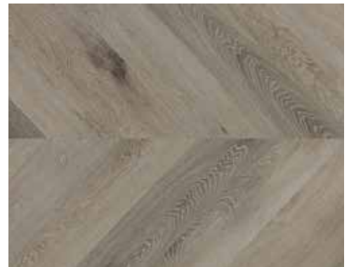
I444518CL4/CHV05 San Matteo Stormy Grey