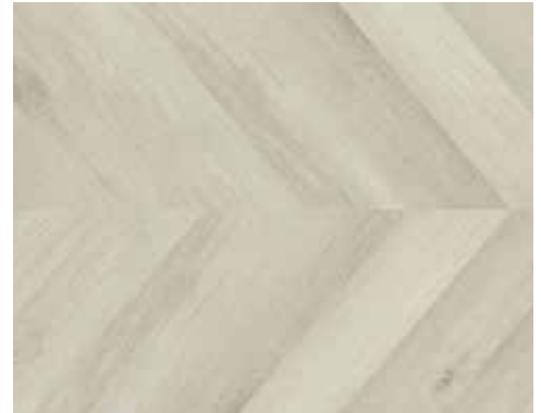
I4445101CL4/CHV04 San Matteo Cloudy