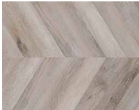
I444515CL4/CHV03 San Matteo Glacier