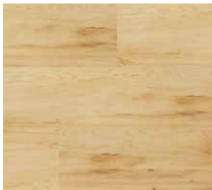
CW-5667/NV06 Chalk Maple