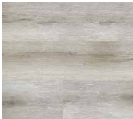
EW-2559/NV02 Agate Grey