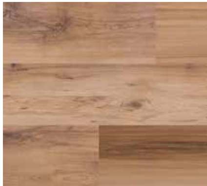
CW-5666/NV04 Mountain Maple