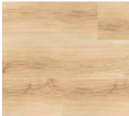
CW-5665/NV05 Florida Maple