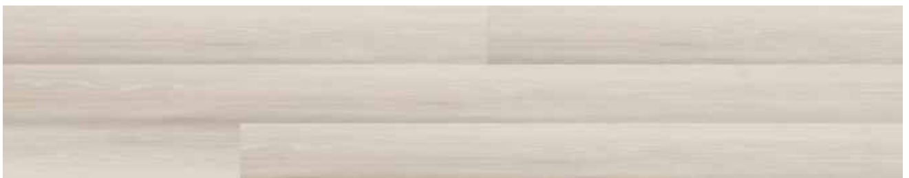
CW1306/NN04 Light Cream