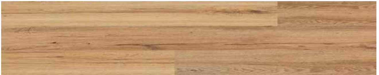
CW263/NN02 Weathered Maple