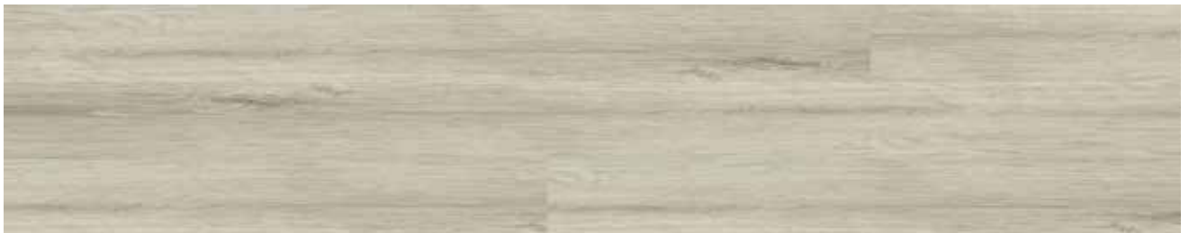
CW2141/NN03 Faded Oak