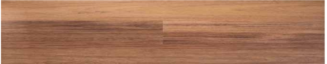
CW1248/NN01 Sweet Barley

With a variety of styles and designs to choose from, you are guaranteed to find a design to suit your home and budget.