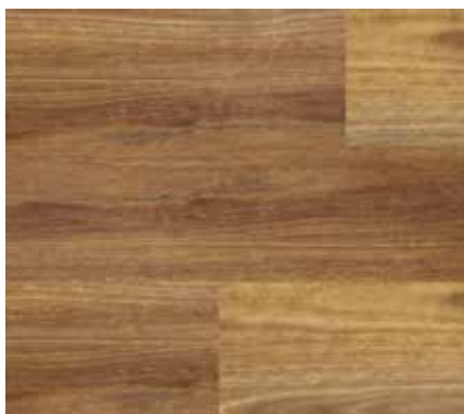
CW-2288/NA02 Spotted Gum