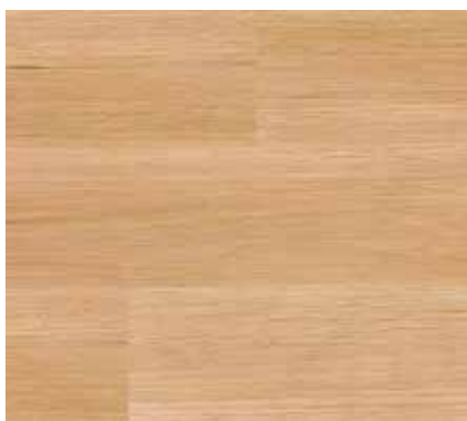
CW-871/NA06 Victoria Ash