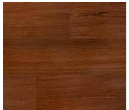
CW-870/NA08 Iron Bark